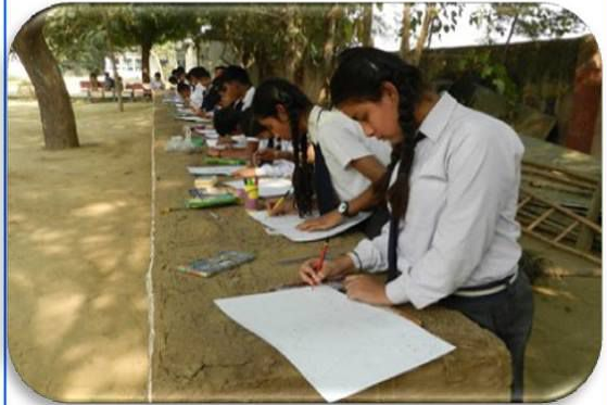
19th of Nov and 25th of December Tender Heart organized a drawing and painting competition where children drew the recent issues in India like demonetization, pollution, corruption etc.